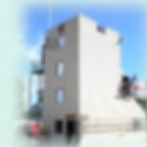
Public Safety Training Tower