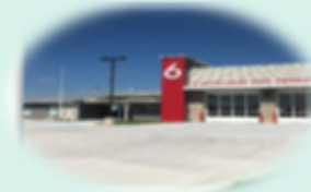
Fire Station # 6