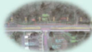
Candies Creek Stormwater Project