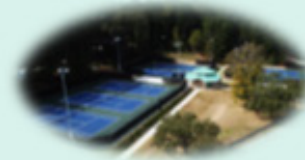
Tinsley Park – Tennis Center