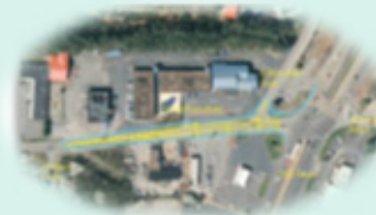
Georgetown/25 th Street Intersection